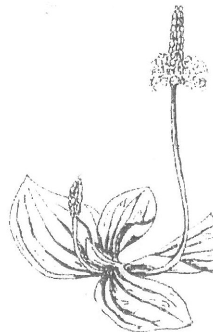
Hoary Plantain Plantago Media

There are hundreds of wild flowers in the Town Walk See how many you can spot!