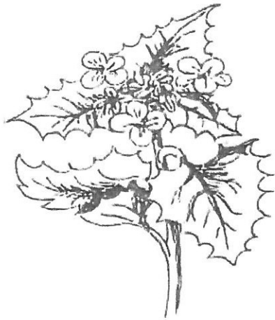
Jack-by-the-hedge (Garlic Mustard) Alliaria Petiolata

Keck, (Hogweed), Ladies Smock, Lords and Ladies, Mallow, Meadow Sweet, Nettle (Common and Dead), Shepherd's Purse, Sloe, St Johns Wort, Sycamore, Teasel, Thistle (Spear and Creeping), Touch-me-not, Vetch (Kidney), Willow Herb (Great Hoary), Wild Carrot, Yarrow.