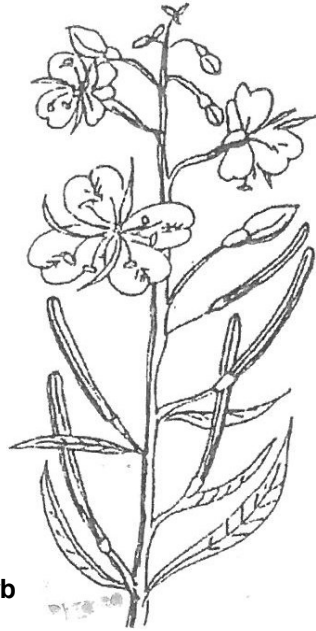
Rosebay Willow Herb (Fireweed) Chamaenerion Angustifolium

Fireweed, Forget-me-not, Goosegrass, Germander Speedwell, Hawkweed, Hawthorn, Ivy (Ground Ivy), Jack-by-the-hedge (Garlic Mustard),